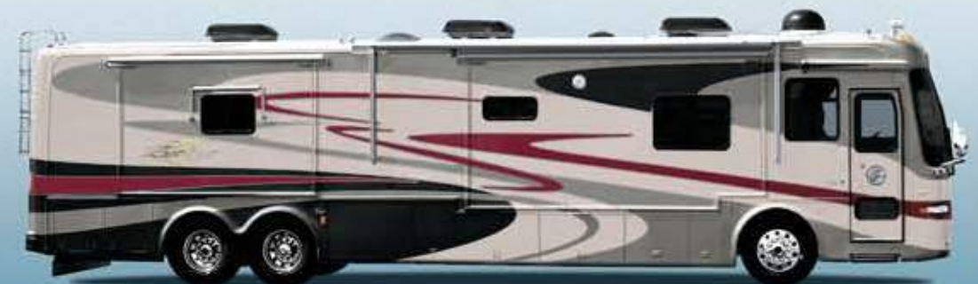
SUNLIT SAND FULL BODY