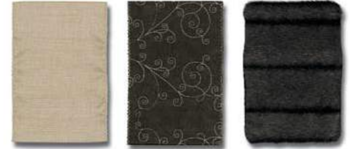
Bedroom Bedroom Accent Bedroom Throw