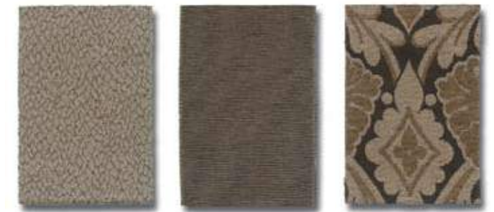
Sofa Living Area Accent Dinette