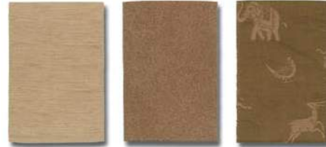
Bedroom Bedroom Accent Bedroom Throw