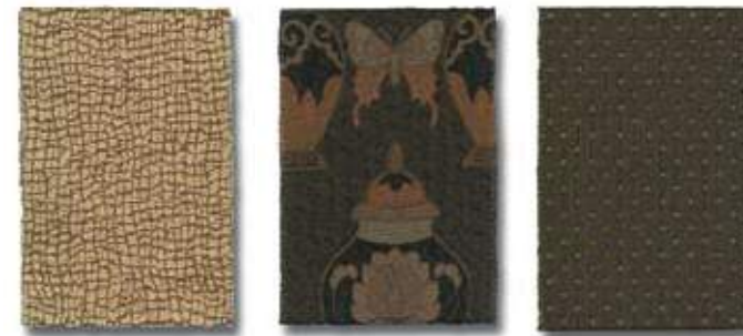
Sofa Living Area Accent Dinette