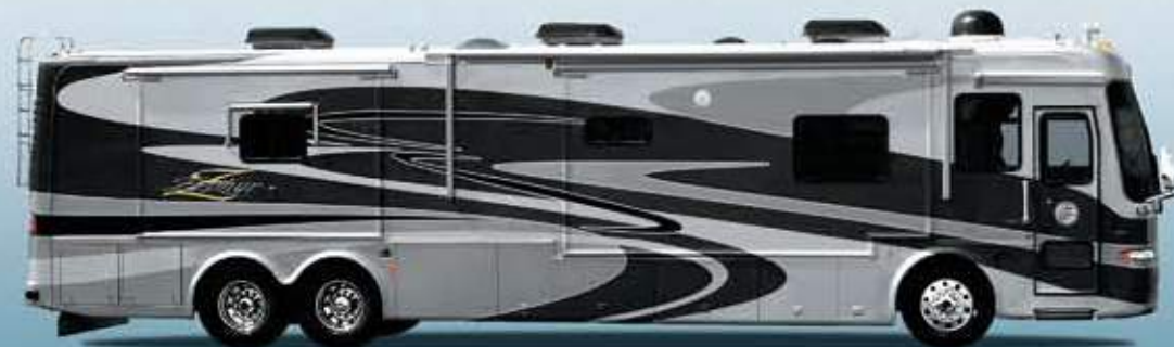
NASA FULL BODY

ADDITIONAL FLOORPLANS MAY BE AVAILABLE ON OUR WEBSITE. www.tiffinmotorhomes.com